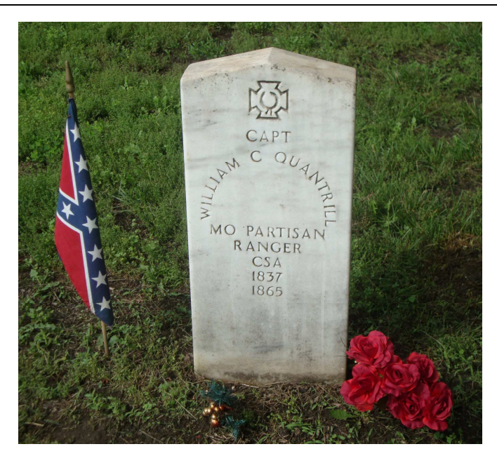
Quantrill's Grave at Higginsville Confederate Veteran Cemetery on Confederate Memorial Day.